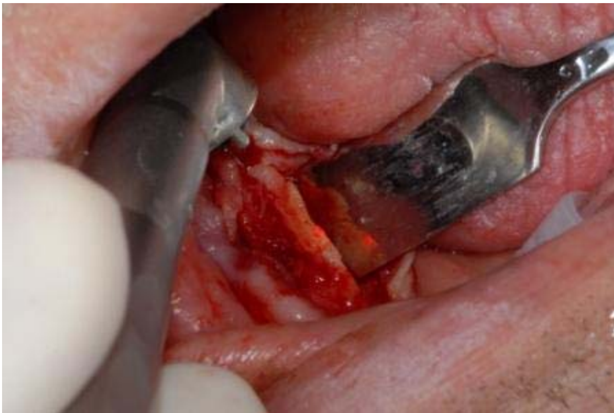
Figure 3: Surgical-conservative approach using Er:YAG

The absence of haemostatic effect in the Er: YAG laser represents an advantage in this case, as it is essential to distinguish, in the surgical phase, the proportion of the avascular necrotic bone from the clinically healthy and vascularized one (bleeding) (Figure 3).