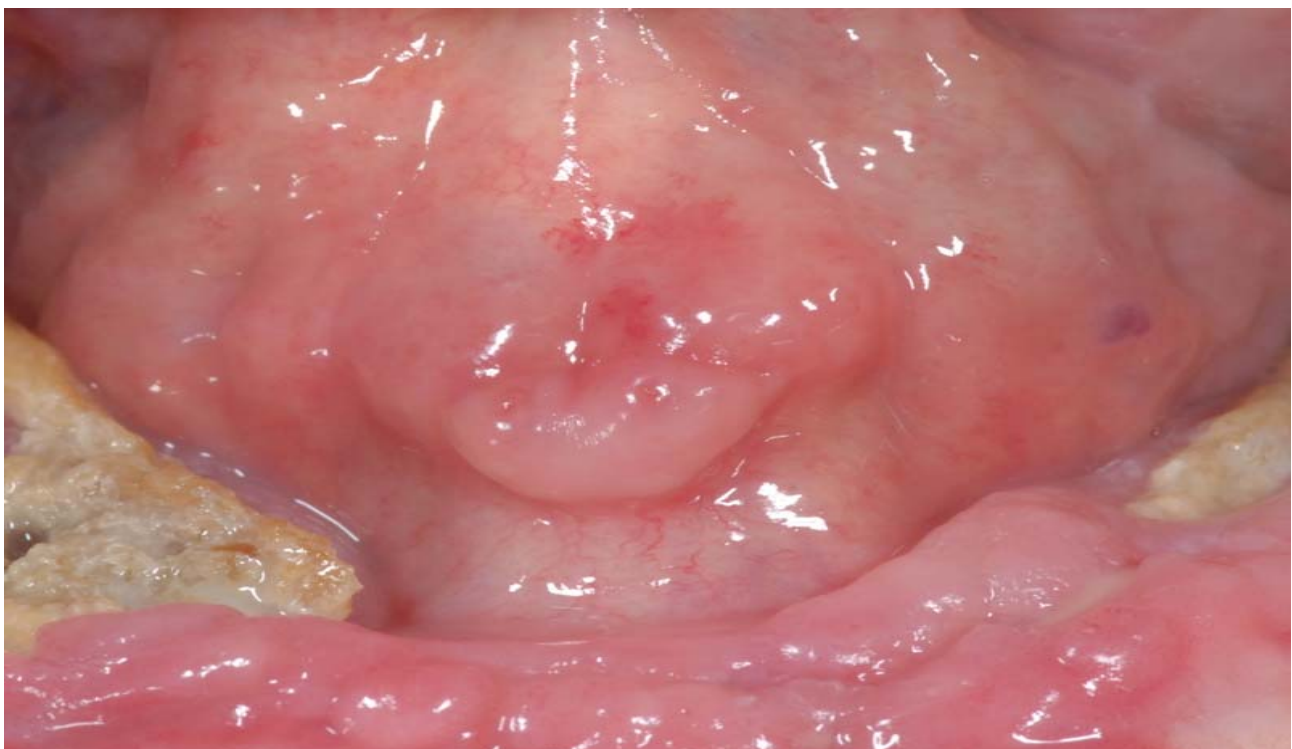
Figure 1: Clinical aspect of ONJ-BF

The fundamental biological action of all bisphosphonates, assumed both orally and intravenously, is represented by inhibition of resorption (anti-osteoclastic action) and then the turnover and renewal of the bone tissue (with the consequent reduction of the calcium levels in serum). By virtue of this mechanism of action, these drugs are used for the treatment of various benign or malignant bone diseases, mainly represented by osteoporosis, Paget's disease, multiple myeloma and osteolytic bone metastases of carcinomas, resulting among the most prescribed drugs in the world.